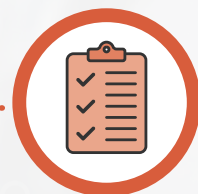
Hygiene Testing and Reporting

We provide visibility and transparency of disinfecting operations with our award-winning Site Management System | "Best Enterprise Wide Transformation Project" during OPEX 2020