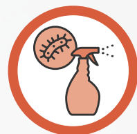
Deep Cleaning and Disinfection