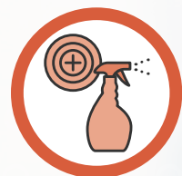
Touch Points Cleaning

Your dedicated Sodexo team will help you assess your disinfection needs based on a risk assessment, establishing a frequency of cleaning, complete inspections to report on cleanliness and perform deep cleaning and disinfection for high-risk areas (such as washrooms, receptions, etc). We also help you prevent transmission between employees & residents with the right guidance on Personal Protective Equipment (PPE) and training.